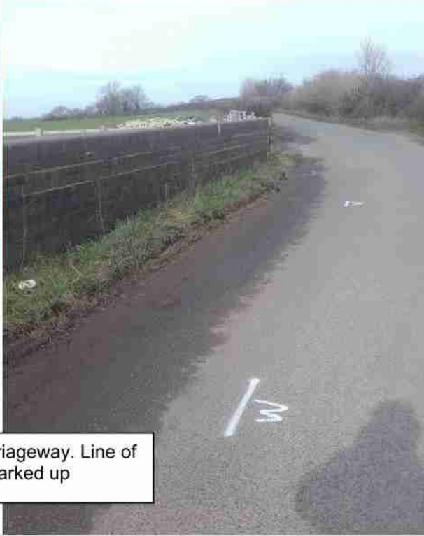
Cat scan carriageway. Line of water pipe marked up