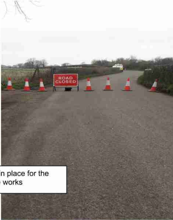
Road closure in place for the duration of the works