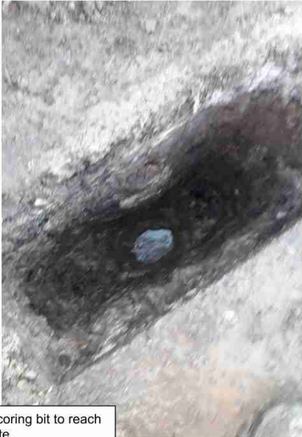
Extending coring bit to reach into concrete