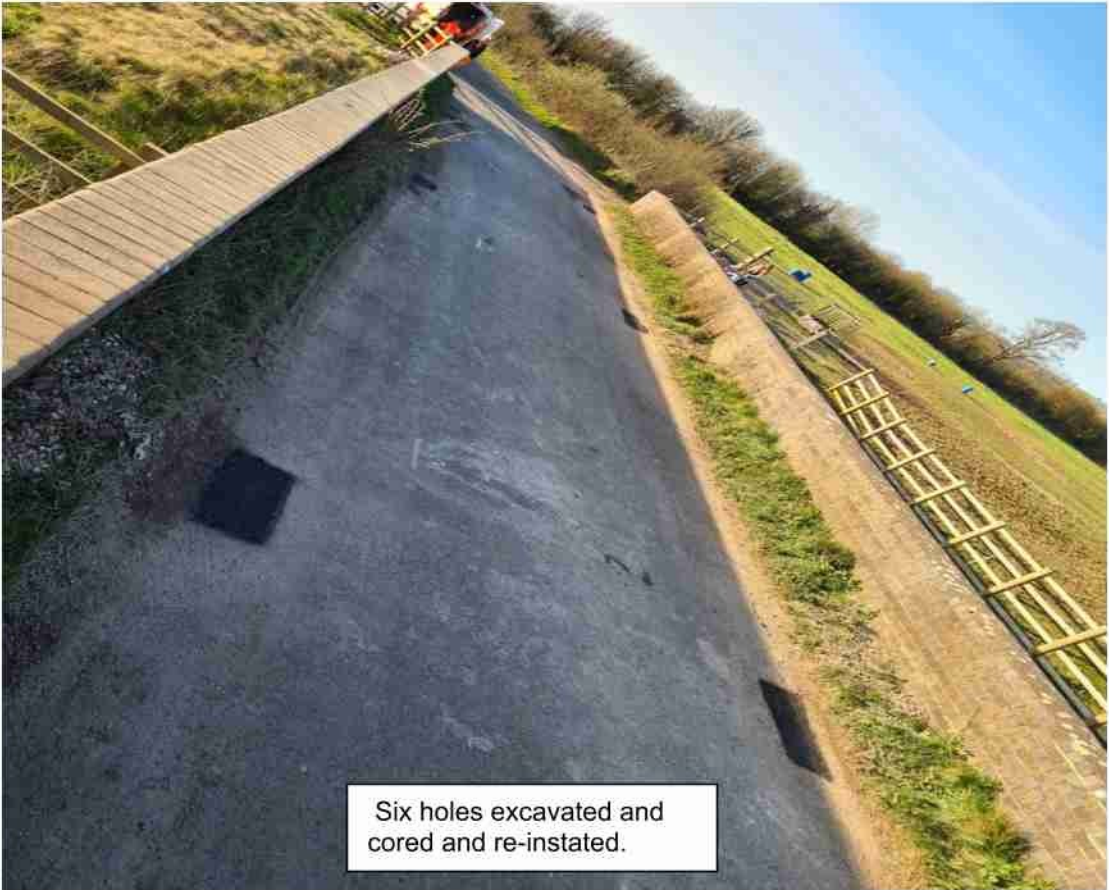
Six holes excavated and cored and re-instated.