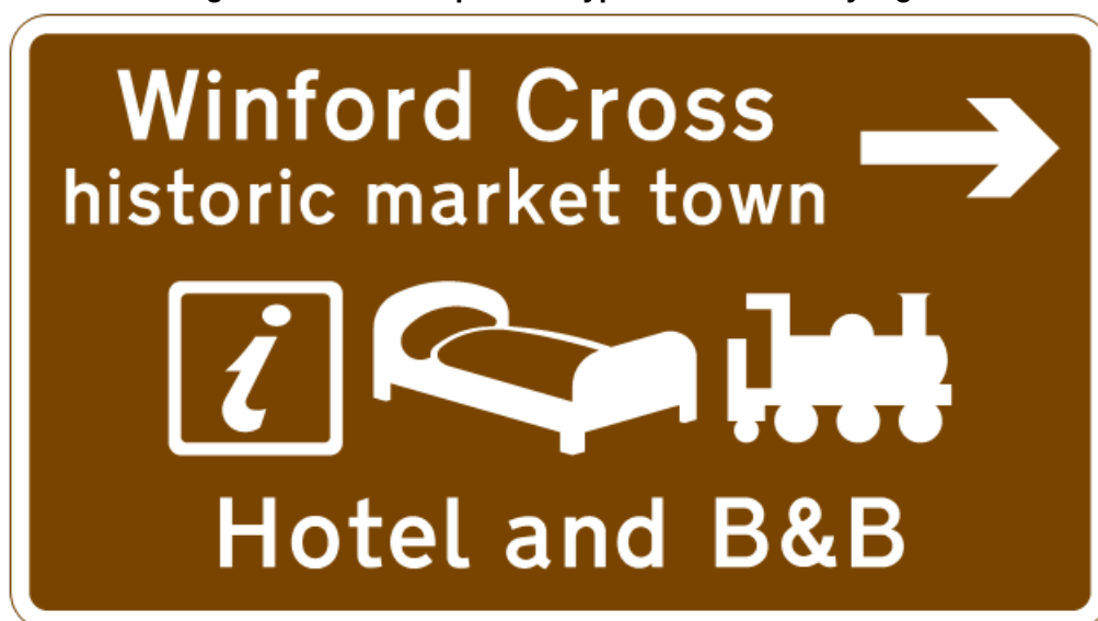
Figure E/6.1.1 Example of a bypassed community sign

E/6.2 Bypassed community signs shall not be permitted for a community that is already signed from an all-purpose trunk road.