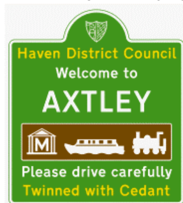
Figure E/4.5N Example of a town or village boundary sign with tourism information

NOTE The sign shown in Figure E/4.5N is a boundary sign that permits the inclusion of a brown panel displaying tourist and leisure symbols.