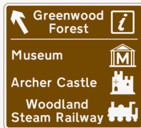
Figure E/3.4N2 Example of collective tourist signing

E/3.5 A descriptive legend shall not be shown on any part of collective signs.