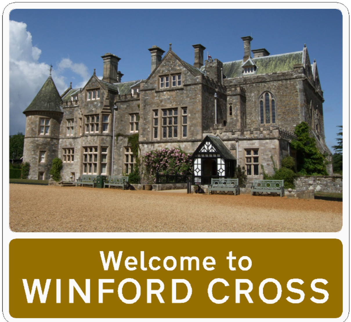
Figure E/4.6N Example of a boundary sign with an image

E/4.7 Historic county areas shall not be depicted using boundary signs with an image.